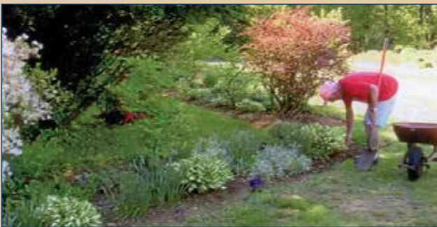
Volunteers Working the Gardens