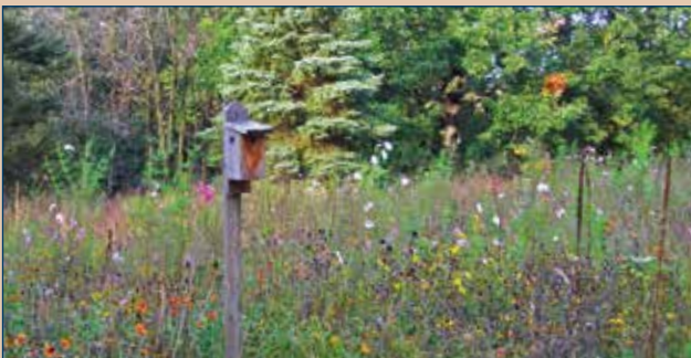
Llewellyn Williams Wildflower Meadow