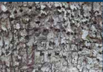
The Work of the Yellow-Bellied Sapsucker