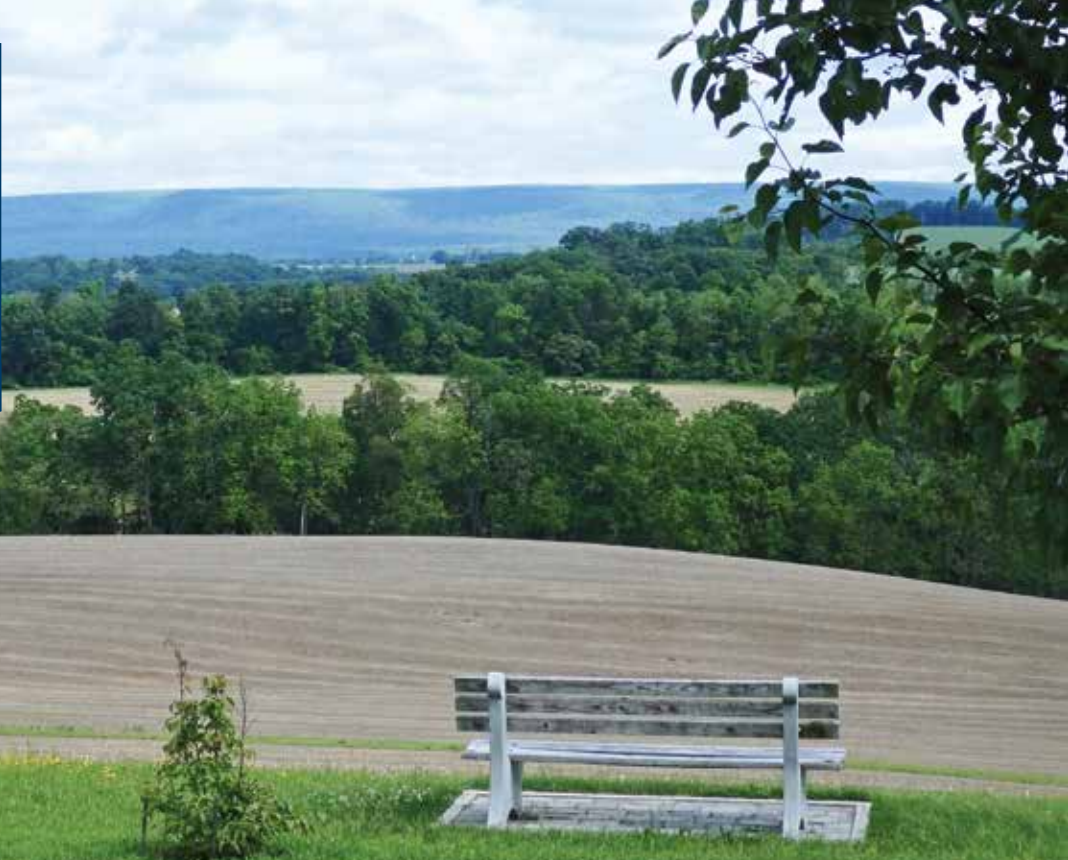
The view to Dr. Rentschler's beloved Blue Mountains from Rentschler Arboretum