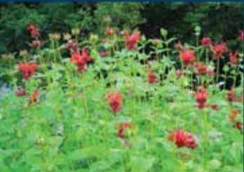
Monarda or Bee Balm