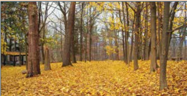
Autumn Paths of Gold