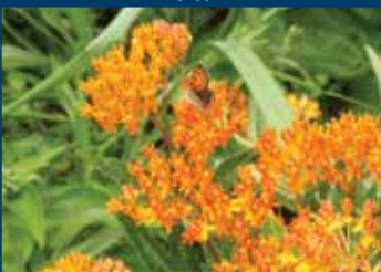
American Copper Butterfly on Butterfly Weed