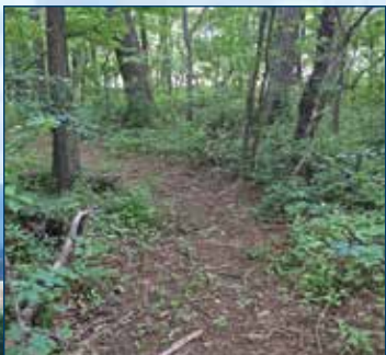
Wooded Hiking Trails