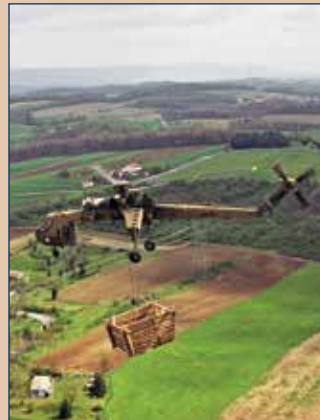
Eagles Nest Shelter being airlifted by Air National Guard from Rentschler Arboretum to the Appalachian Trail above Shartlesville, 1988