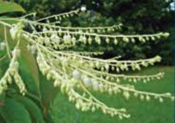
Sourwood or Sorrel (Oxydendrum) Tree